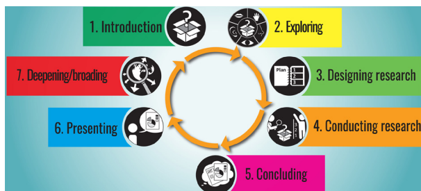
Fig. 1. The phases of inquiry-based learning (Van Uum et al. 2017).

The DGDEE has for years made efforts to popularise teaching strategies through scientific inquiry in geographical education (Sypniewski 2015a, b, Sypniewski 2017a, b, Sypniewski 2018).